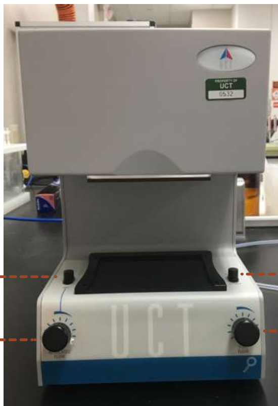
Regulated Flow Knob