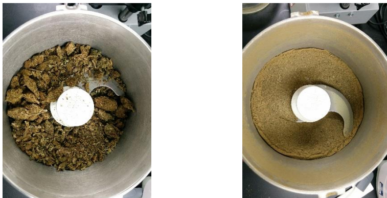
Figure 1. Cannabis sample before (left) and after (right) homogenization with dry ice.

Cannabis should be ground to a fine powder using cryogenic milling (e.g. SPEX 6775 Freezer/Mill®). For this work a large quantity (100 g) of marijuana was thoroughly blended in a Robot-Coupe® using dry ice to generate a homogenous sample for use during method development and recovery experiments.